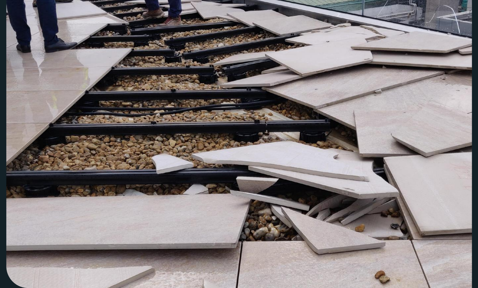
Tiles on a roof terrace which have been damaged by wind uplift.